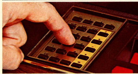
The Bally console keyboard is used to select specific programs from each cassette.

The most significant expansion accessory will be the dual magnetic tape decks with an alpha numeric (typewriter) keyboard. With this accessory package, which will cost under $500 and be introduced by JS&A next year, you can record data and software programs and do everything you can do on any main-frame computer system within the data storage capacity of the Bally unit.