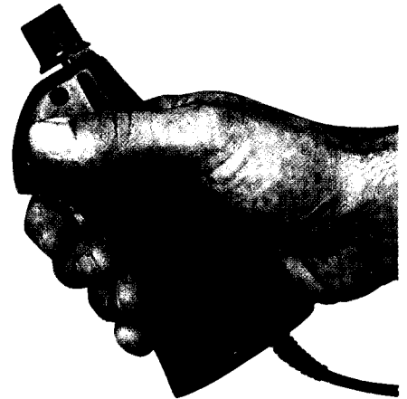
The pistol grip accessory is used for the video games and is an optional accessory.

BlackJack/Acey-Deucey/Poker These one, two, three, or four player games are part of the home entertainment series. Pictures of the playing cards are shown and shuffled right on the screen. The cartridge is a great party game and available for only $20.