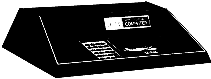
The basic unit of JS&A's new Home Library Computer system can be used as an electronic scrolling calculator, a teaching machine or a home video arcade game.