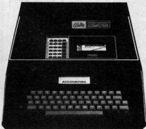
Prototype of the Bally keyboard unit which was never manufactured.