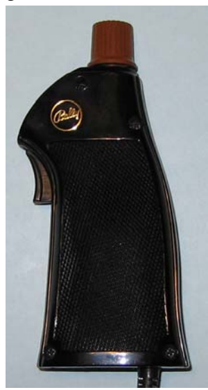
A Regular Astrocade "Hand Controller"

ICBM Attack cartridge came with an analog controller that is absolutely required to play the game.