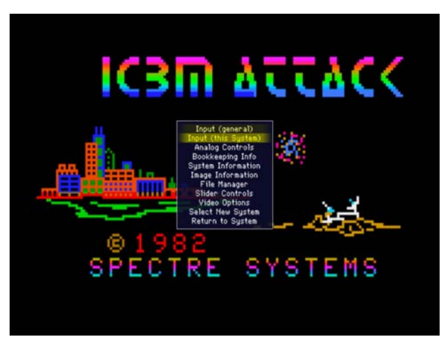
Pressing Tab brings up the Menu