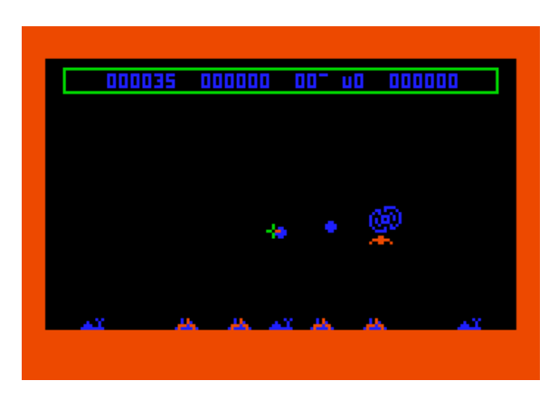
The Player's Explosion Has a One-Pixel Gap (See Tip 14)