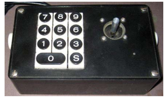
Spectre ICBM Attack Handle

When starting ICBM Attack on a real Bally / Astrocade console the player will be greeted by a black screen when the game