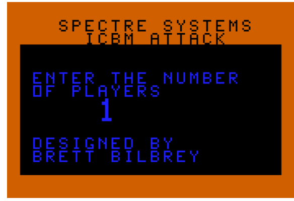
ICBM Attack supports up to four players.