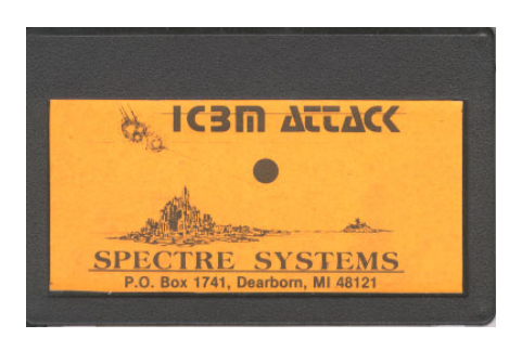
The ICBM Attack Cartridge

Besides being extremely rare, there is something else that sets ICBM Attack apart from the rest of the other Astrocade cartridges. The game does not use the regular Astrocade "hand controller" that every other cartridge game uses. Each