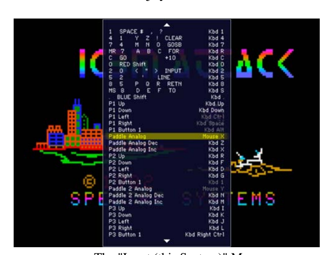
The "Input (this System)" Menu

It may be necessary to reverse the direction of the paddles. First try playing the game before you do this step as it may not be needed for your controller. Start the game. If the controller is pressed right but the cursor moves left, then you will need to "Reverse Paddles." This is easy to fix. Using the same steps as above: Press Tab. Choose "Analog Controls." Change the setting for "Paddle Reverse" and/or "Paddle 2 Reverse" to On.